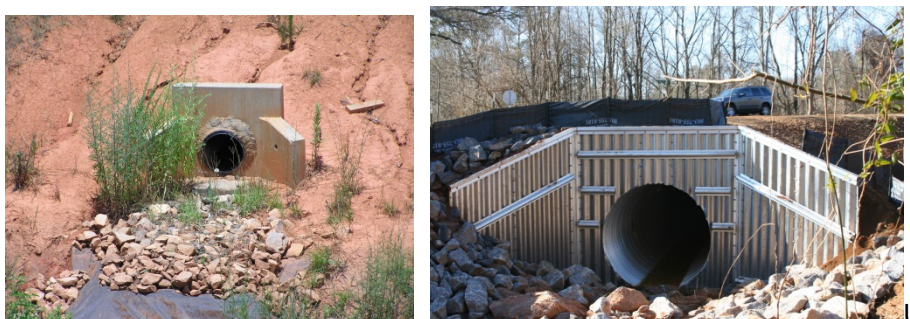
Section when specified in the plans or special provisions.

Use Pipe Flared End Section when specified in the